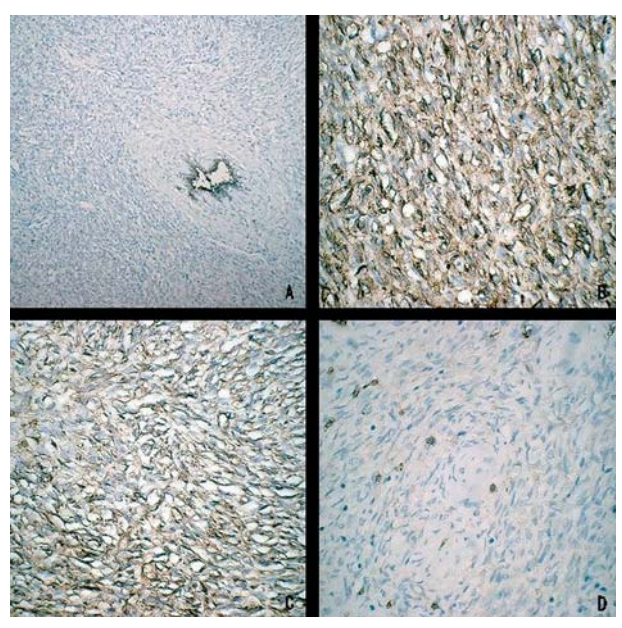
Fig. 3: Immuhistochemical profile. A. Cytokeratin 7 stain showing a strong reactivity in the normal ductular cells. No positivity is seen in neoplastic cells (DAB, 100X). B,C. CD34 and CD99 expression in the spindle-shaped tumour cells (DAB, 400X). D. Mast cells are inmunoreactive to CD117. Note the negativity in the tumour cells (DAB, 400X).

tumour cells showed expression for vimentin, CD34, CD99 (fig. 3). Focal positivity to bcl-2 was present. Epithelial, neural, muscular markers and c-kit (fig. 3) were completely negative.